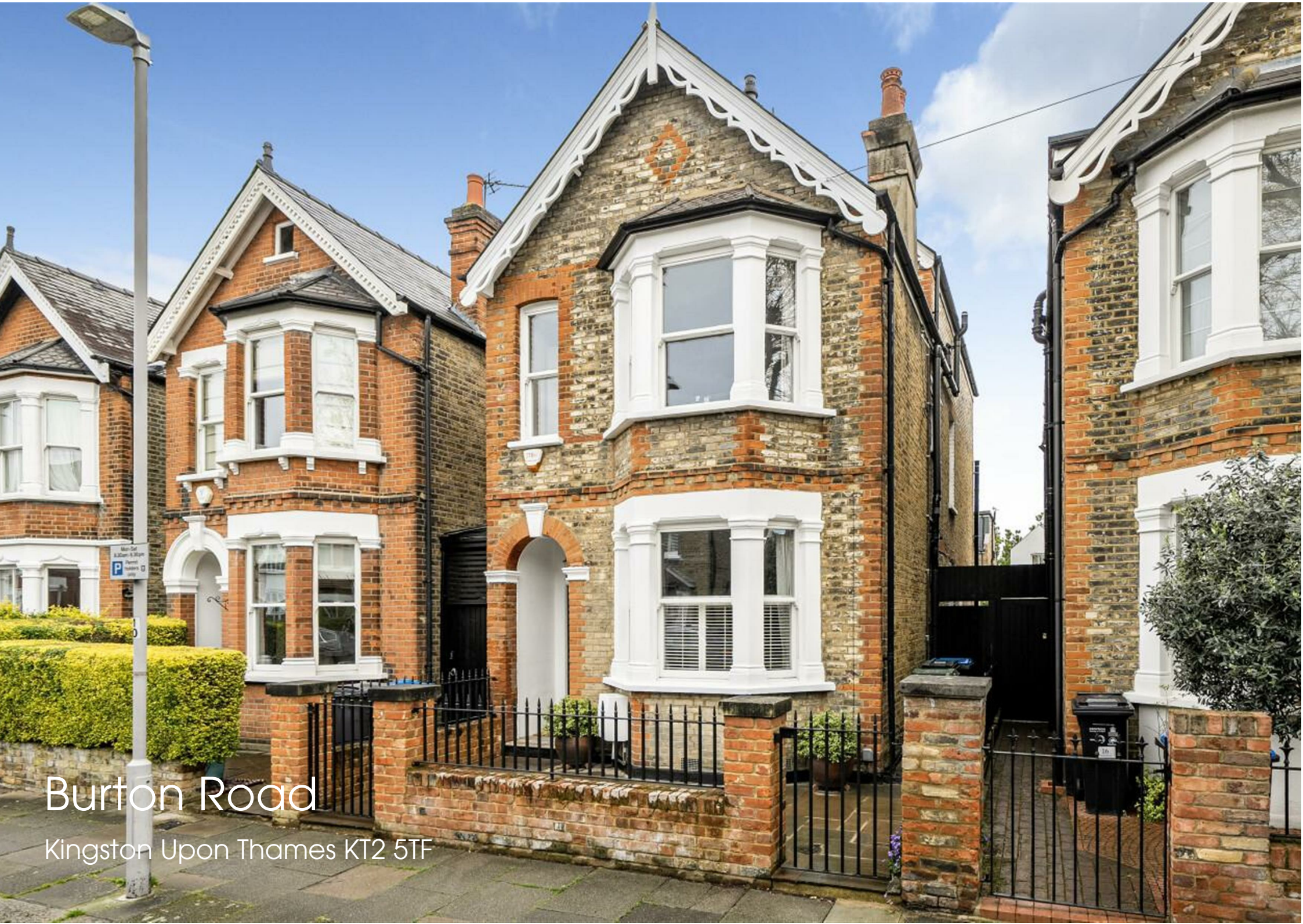
Burton Road Kingston Upon Thames KT2 5TF